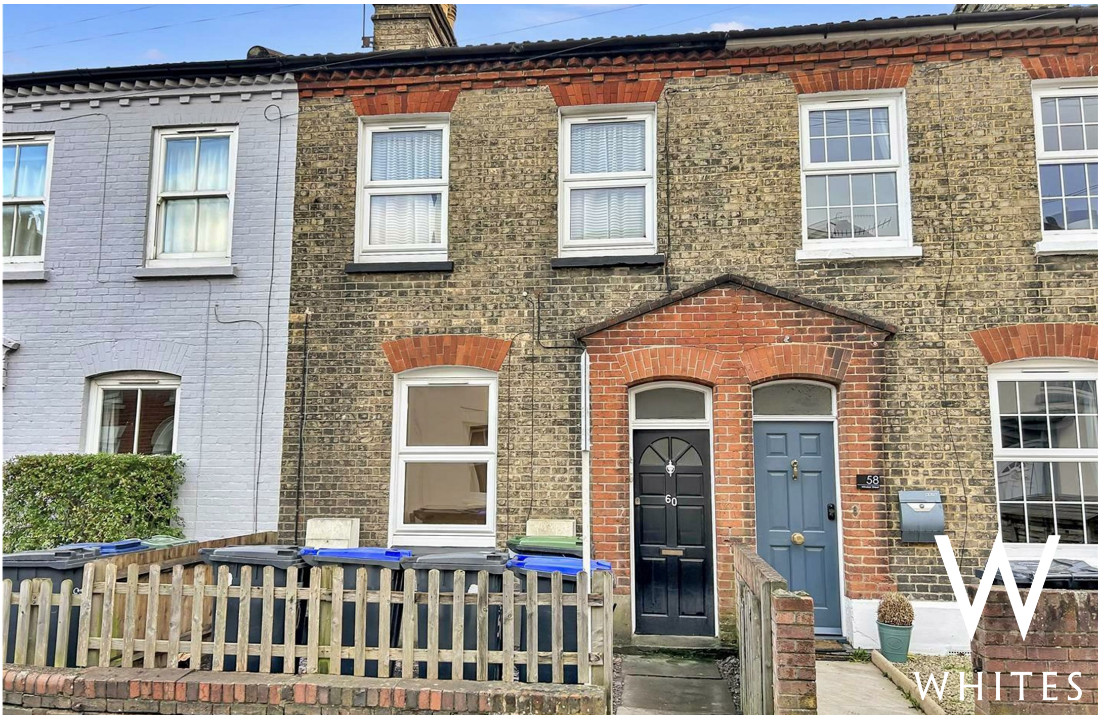
The First Floor Flat, 60 Windsor Street, Salisbury, SP2 7EA